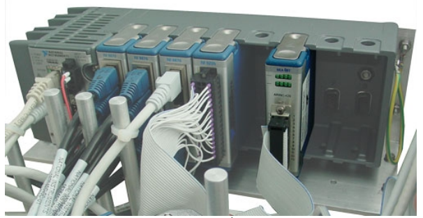
Fig. 4: Connected SEA 9811 module in the 6th slot